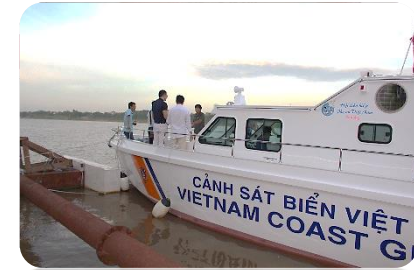
Patrol Ship MS 50S