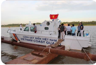
Patrol Ship MS 50S