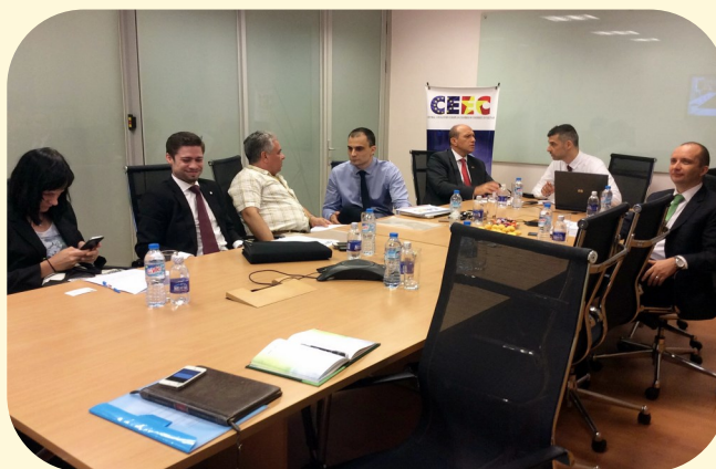
CEEC Advisory Committee in Hanoi