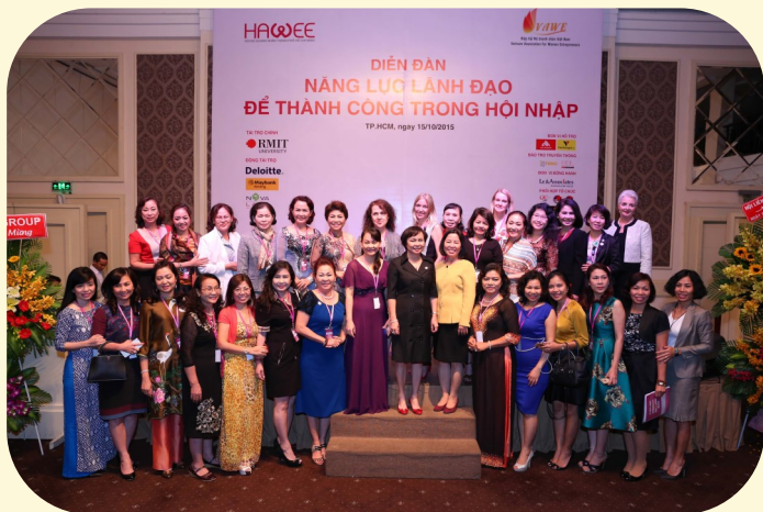
Female Entrepreneurs attending HAWEE's Conference